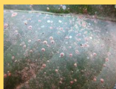
California red loose